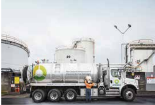
Juggler trucks enable on-board separation and dewatering to reduce waste disposal