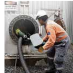
Confined space vacuum loading completed safely